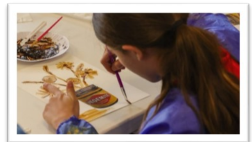
Painting with Vegemite: Navarre Primary School, Victoria, 2023.